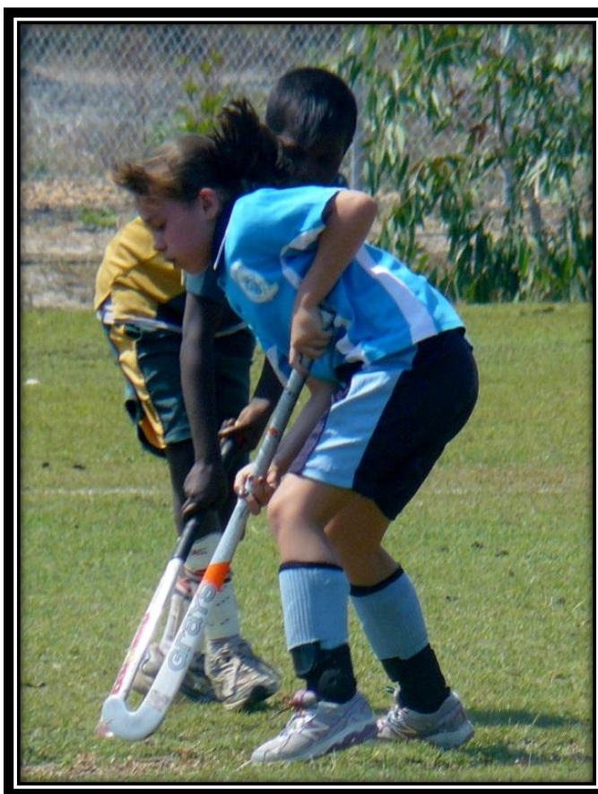
Karumba -v- Normanton Grade 4/5 Finals

WE ACKNOWLEDGE THE SUPPORT OF THE AUSTRALIAN GOVERNMENT – DEEWR THROUGH THE FUNDING SUPPORT TO DELIVER THE NO SCHOOL NO PLAY PROGRAM