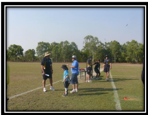
AASC Program Staff supporting the Karumba Hockey Carnival

Support for this program is received through INDIGENOUS SPORT AND RECREATION PROGRAM, DEEWR NO SCHOOL NO PLAY PROGRAM and a significant contributor to the long term success of this program in the QUEENSLAND GOVERNMENT – SPORT AND RECREATION SERVICES. Working together to deliver complimentary outcomes strengthens the ability of programs such as ours to be successful in our ultimate aim to support sustainable community hockey programs.