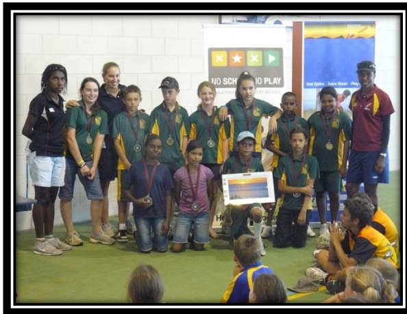
Normanton 6/7 Winners