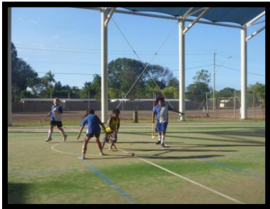
Hook in2 Hockey and small games