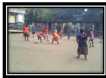
Murray Island Local Hockey Program