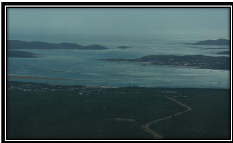
Thursday island from above Horn