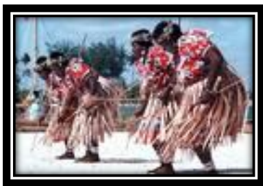
Traditional Dancers of Murray Island

This report is designed to advise on how each of these focus areas are addressed and how as a result, the emerging hockey program builds a slow but steady presence across the region and opens many opportunities for participants.