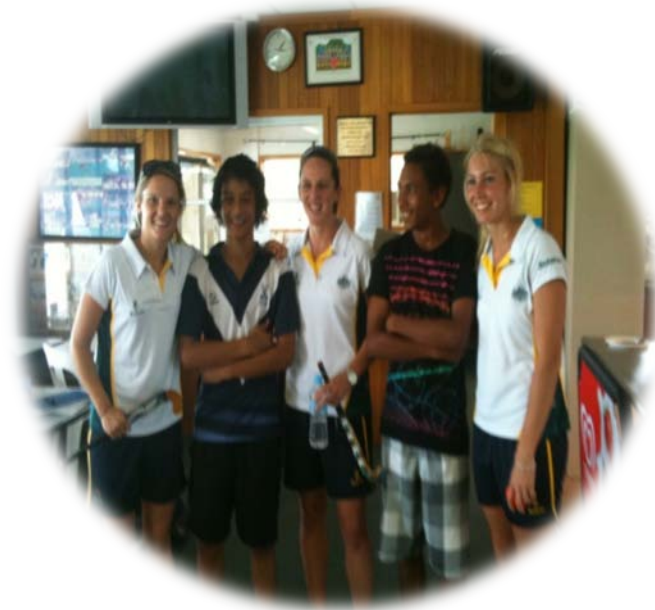
Hockeyroos interacting with 2 athletes at the Camp

It was identified that conducting this camp to complement the Hockeyroos –v- Argentina Test matches scheduled to be played in Townsville 24-28 March 2010. Value adding was achieved by scheduling the camp on the 25 th and 26 th March 2010 which allowed the athletes the ability to watch a test match and also watch team training. Most significantly, it allowed the camp athletes to meet some of the Hockeyroos as part of the camp process and discuss issues important to their future. The benefits of this interaction should not be under estimated. Role models rate highly to this age grouping.