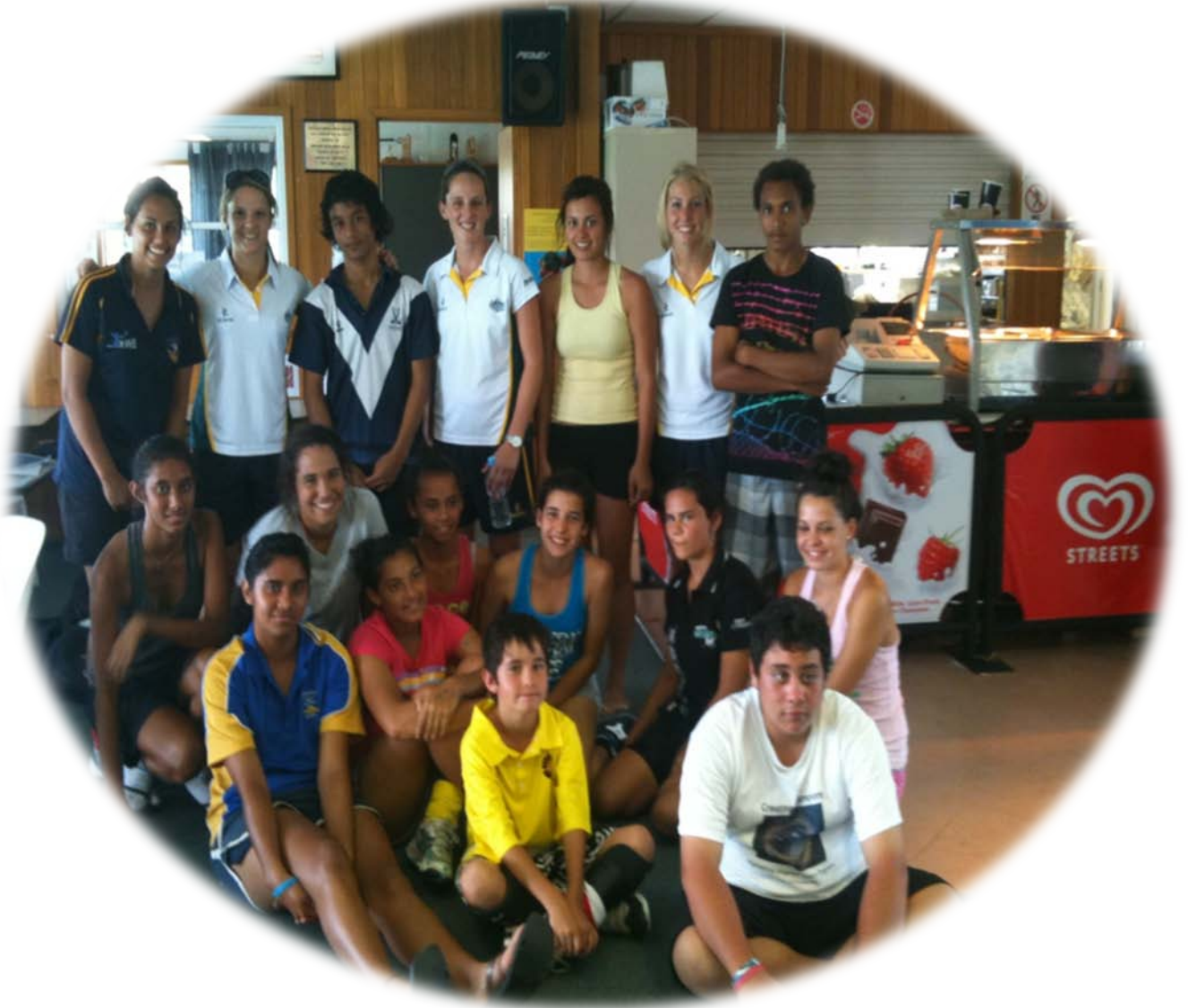
Camp Participants with Hockeyroos

HQ Remote and Indigenous Hockey Development Program and Hockey Australia Partnership