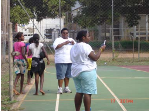
PCYC Supports of Hockey Program

2012-2013 Roll out programs and connect with competition and pathway programs as part of a whole of community approach