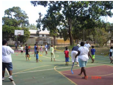
Arakun Hockey Program