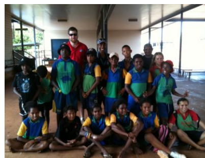
School and Community Hockey Program across the NPA

Review and Feedback was available during the 4 days and conversed with cross community representatives who all were happy to discuss the more general issues of community program partnerships as well as hockey specific details.